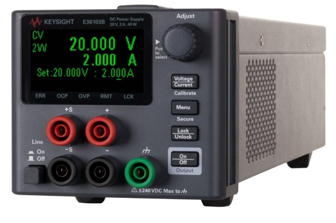
Option J01 recessed binding posts

Do you need to convert the power supply for different mains power? The two switches on the bottom of the instrument make it straightforward. See the product manual for details.